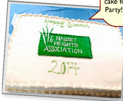
A New Tradition: NHA logo cake for Lawn Party!