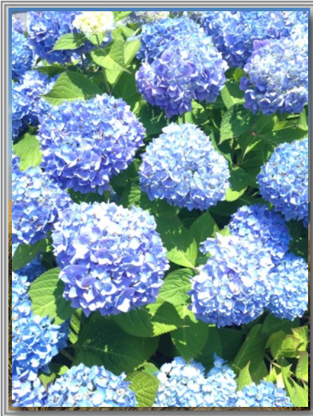
Hydrangeas reigned in our Summer gardens