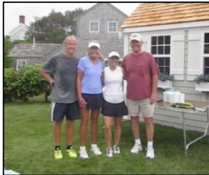
Tennis Tournament Winners