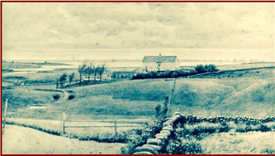
Late 1600s - Pencil drawing of the Oliver Doane Homestead; the first farm on Nauset Heights after the Nauset Indians. Note the Mill Race to the left and cows to the right.