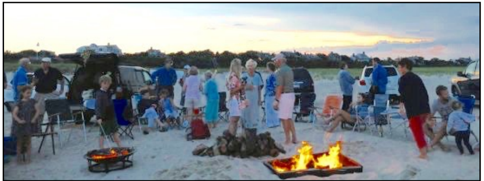
Our Beach Bonfire was a fun event for all ages!