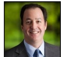
Tim Hunt 2018