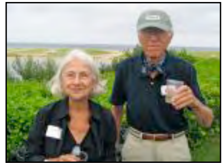
What a perfect setting we had for our Lawn Party.