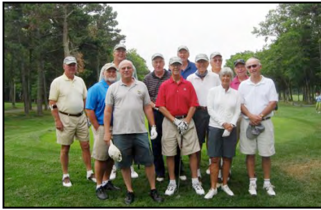
We had a large group of NHA golfers at our Golf Tournament in 2011. Consider joining them this summer.