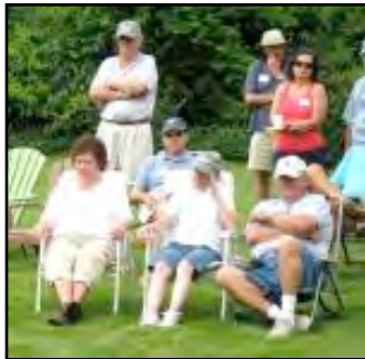
Good food and company is always a hit.