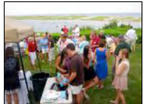
NHA provides activities for young and old.

Enjoying our beautiful community as we picnic and share good times makes NHA a very special organization.