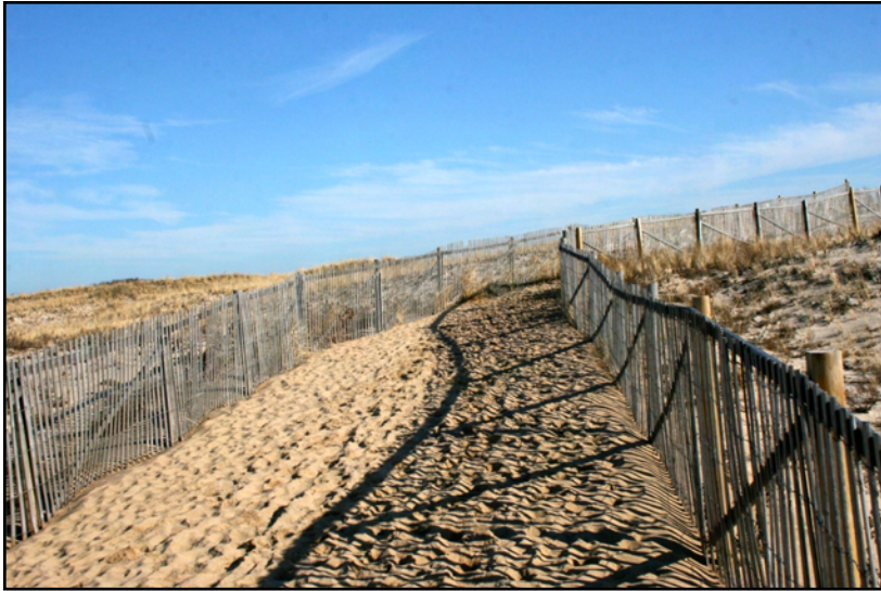
BEAUTIFUL NAUSET HEIGHTS

Nauset Heights Association Has A Wonderful Year Planned for 2012.