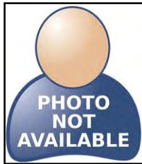
Adele Bloomfield, 2013