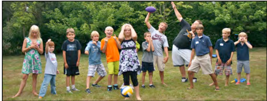
Nauset Heights Association is composed of families and retirees, children, and grandchildren. We plan activities and fun events for all ages!