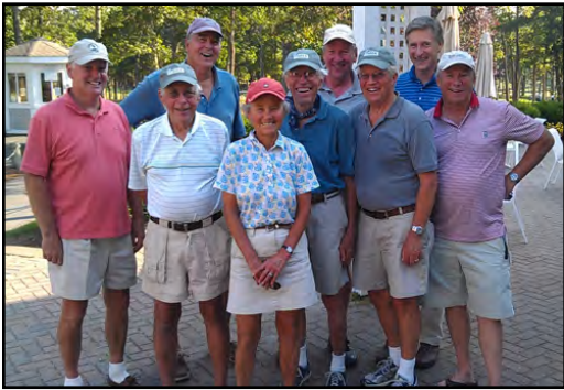
We had a large group of NHA golfers at our Golf Outing in 2012. Consider joining them this summer.