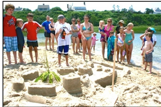
Last summer's Sand Sculpture Contest was a fun event for all ages!