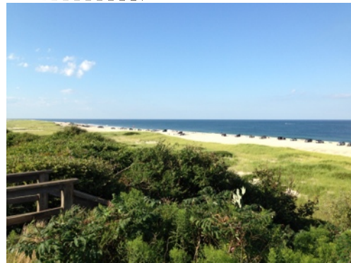
Photo of Nauset Heights, summer of 2013