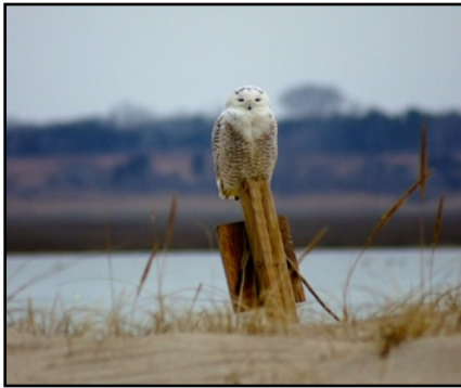
Photo of Snowy Owl, Feb. 15, 2014