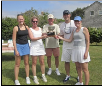
Our Tennis Tournament was well enjoyed. Consider joining them this summer as a player or spectator.