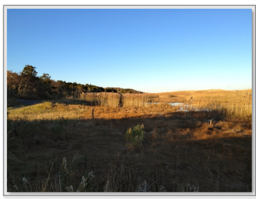
FALL IN NAUSET HEIGHTS